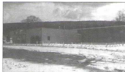
Pictured above is the New Dan Wesson Manufacturing site in Norwich, N.Y.

staffing, equipment, tooling and fresh ideas. These are all key issues that the new management felt was needed to bring Dan Wesson Firearms back into production. Much research was conducted; consulting with past Wesson employees, national marketing groups, and the most important, you, the Dan Wesson customer. After this intense research was completed the NYI team set the ground work in place to resurrect the New Dan Wesson. The project now is well under way and NYI will keep you updated as we progress on our quest. Dan Wesson Firearms is now settled into it's new modern manufac-