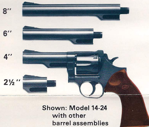
Shown: Model 14-24 with other barrel assemblies

These revolvers are also available as .38 specials only in the 8-2 Series which is identical in looks and price.