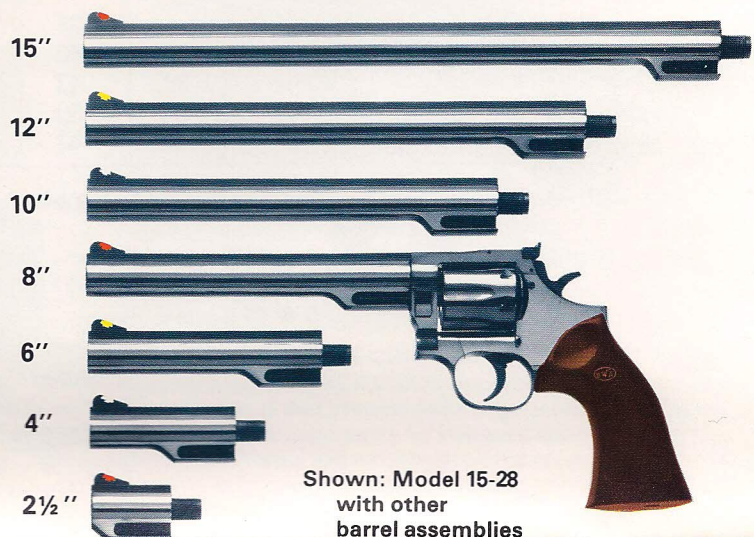
Shown: Model 15-28 with other barrel assemblies

These revolvers are also available as .38 specials only in the 9-2 Series which is identical in looks and price.