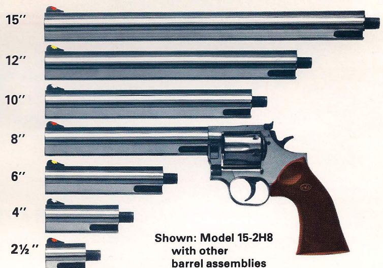
Shown: Model 15-2H8 with other barrel assemblies

These revolvers are also available as .38 specials only in the 9-2H Series which is identical in looks and price.